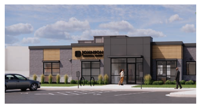
WEST TOWNE MADISON BRANCH RENDERING