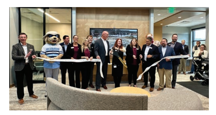
DELAFIELD BRANCH GRAND OPENING