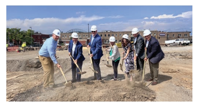
WEST MILWAUKEE BRANCH GROUNDBREAKING