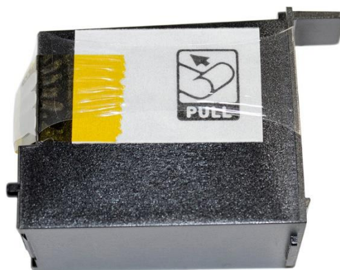
Remove Tape Seal

Step 2: Open the ink cartridge pouch and remove the protective tape covering the ink nozzles. Be careful not to touch the ink nozzle with your fingers or allow it to come in contact with anything else.