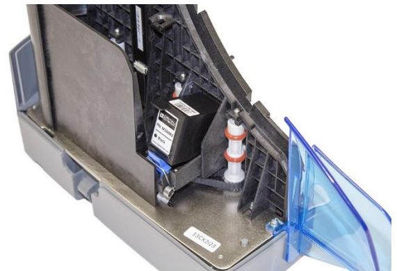
Insert at slight angle