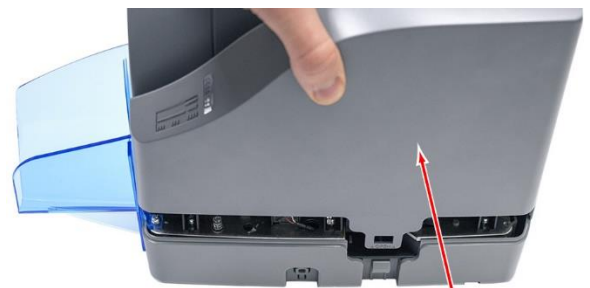
Lift cover up to remove