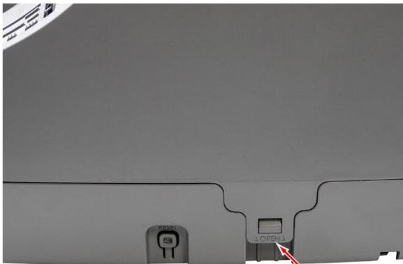
Pull tab to open

Step 1: Gently pull out the tabs on both sides of the scanner cover. Lift up on the cover to remove it and provide access to the inkjet platform.