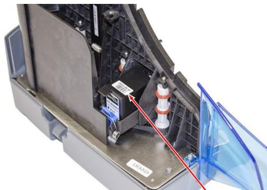
Push down on cartridge